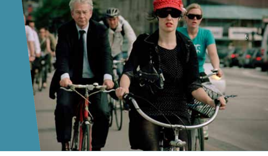
Public life is everyday life