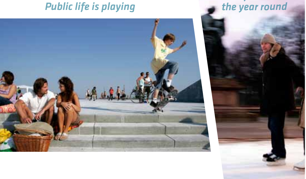
Public life is recreation