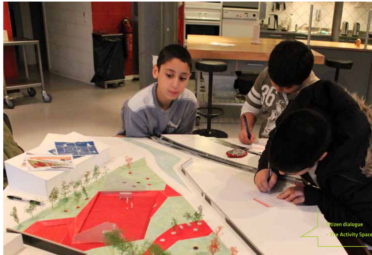
Citizen dialogue - The Activity Space

Gl. Valby will become a district which buzzes with creativity and offers a myriad of opportunities for self-expression both indoors and out. The area's image and attractiveness will be strengthened so that it also becomes an appealing district for those who live elsewhere.