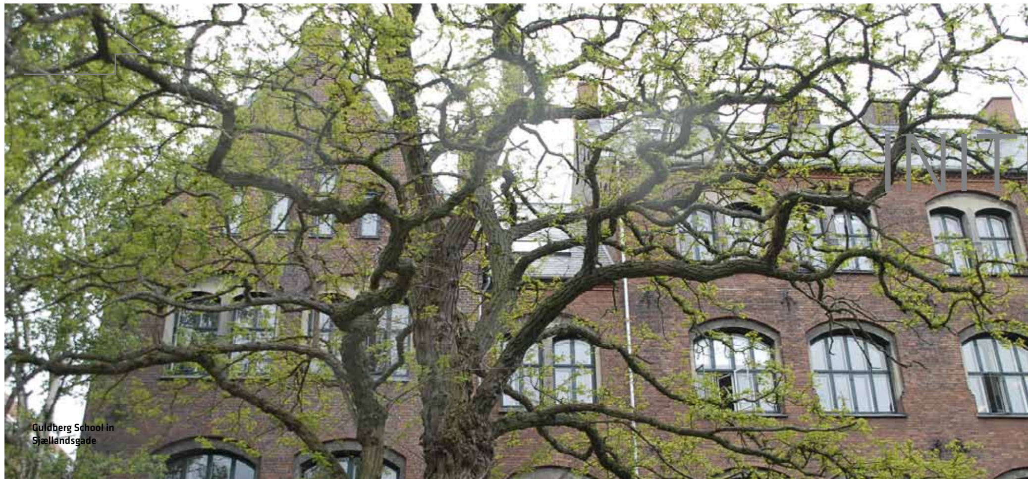
Guldberg School in Sjællandsgade