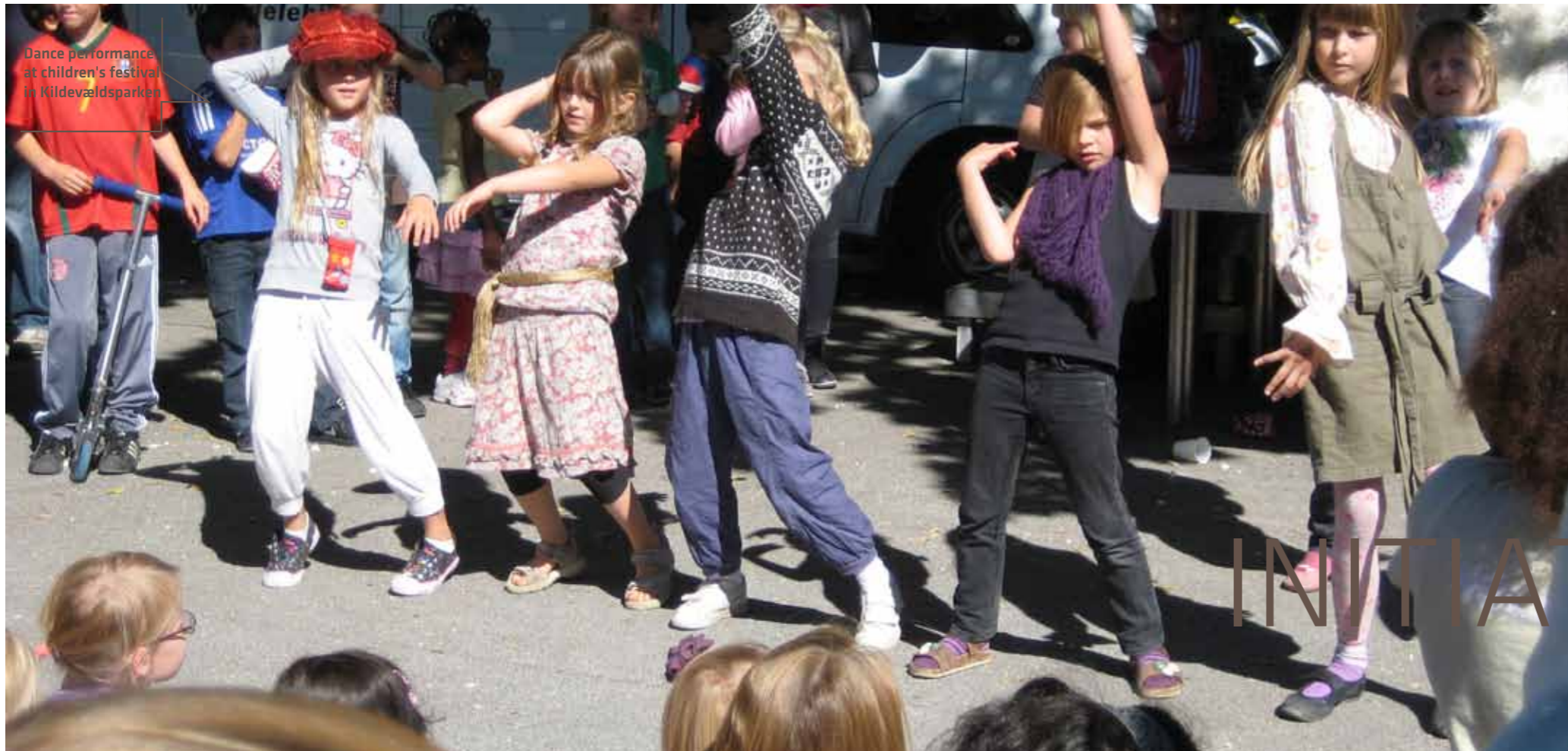
Dance performance at children's festival in Kildevældsparken

Integrated urban renewal of the Skt. Kjelds district is intended to improve the life quality of the district's residents. Physical planning and the improvement of buildings, open spaces and roads will, together with various social initiatives, motivate residents to follow a healthy, active lifestyle. An active lifestyle which in future will be reflected in the everyday urban landscape.