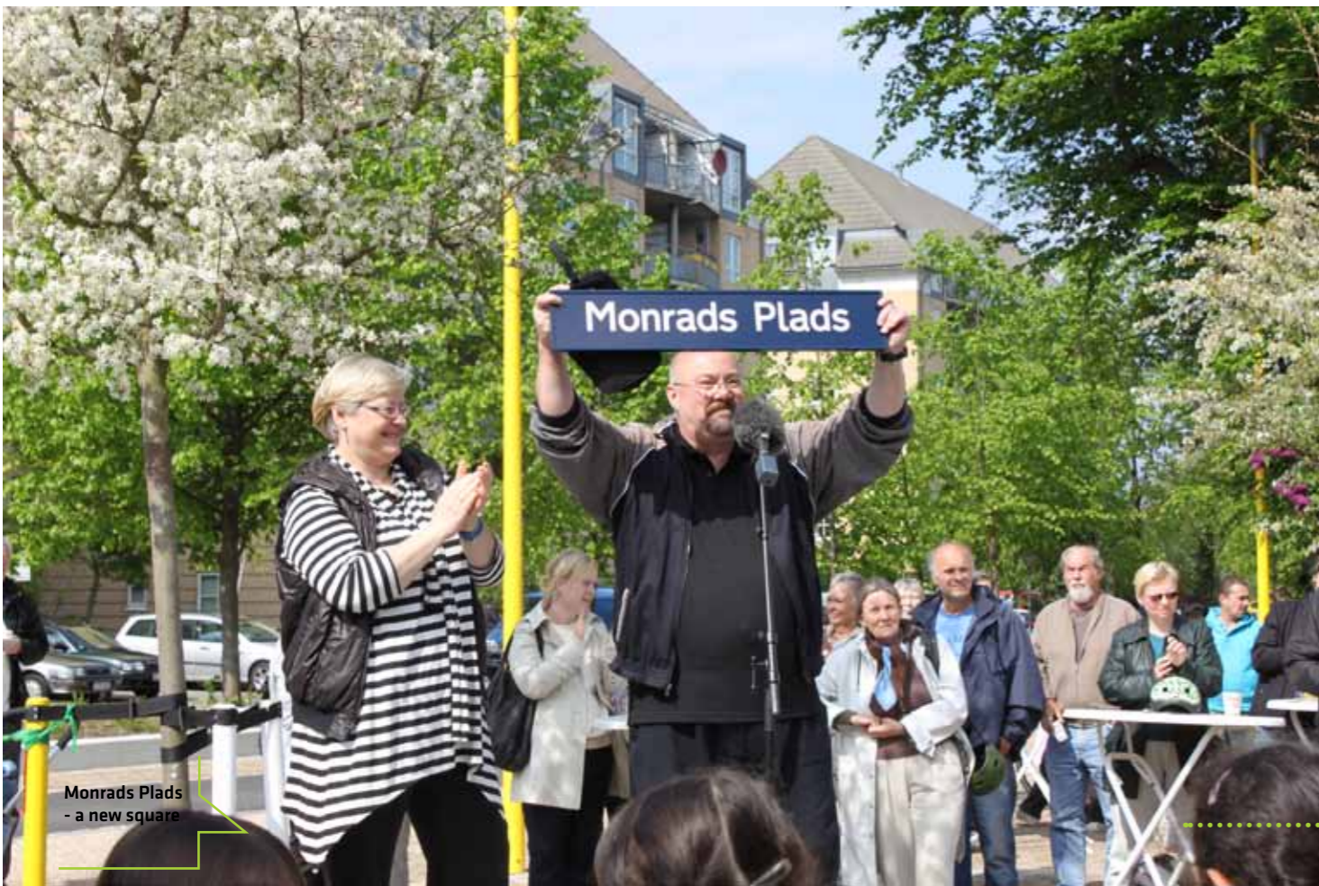
Monrads Plads - a new square

More recreational stretches of streets, attractive urban rooms and green oases and squares will provide a framework for the area's diverse urban life, attracting people to pass the time of day there and participate in physical activity.